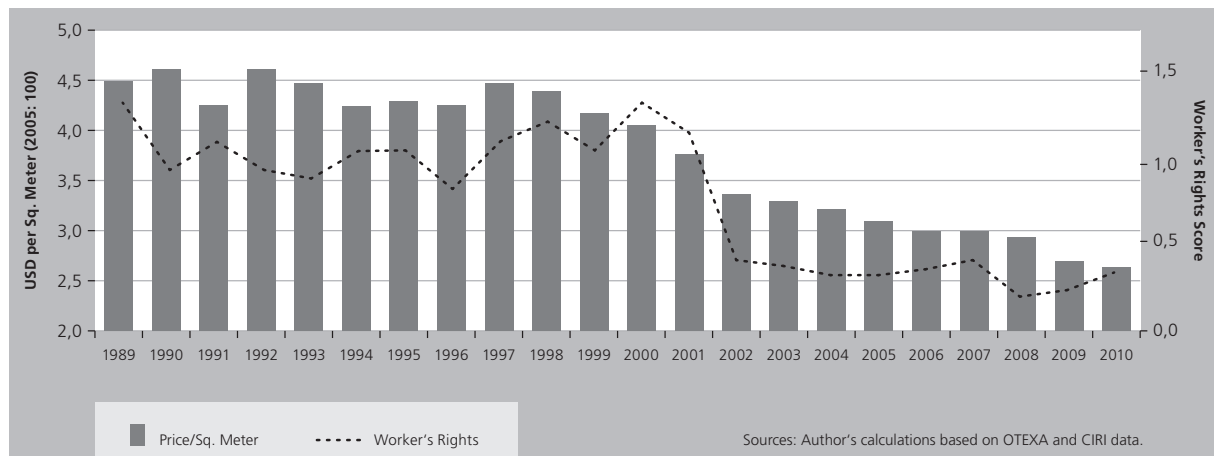
Figure 3 Price Paid per Square Meter (real USD) versus Workers' Rights in Top 20 Apparel Exporters to the United States

global apparel sector has been a race to the bottom, i.e., the economic push for competitiveness has won out over the pull for stronger workers' rights regimes.